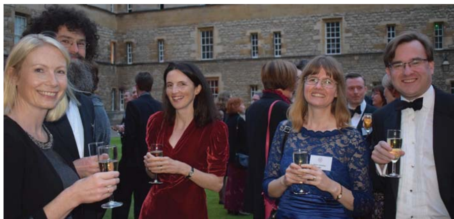
ABOVE AND LEFT : 24 SEPTEMBER 2016