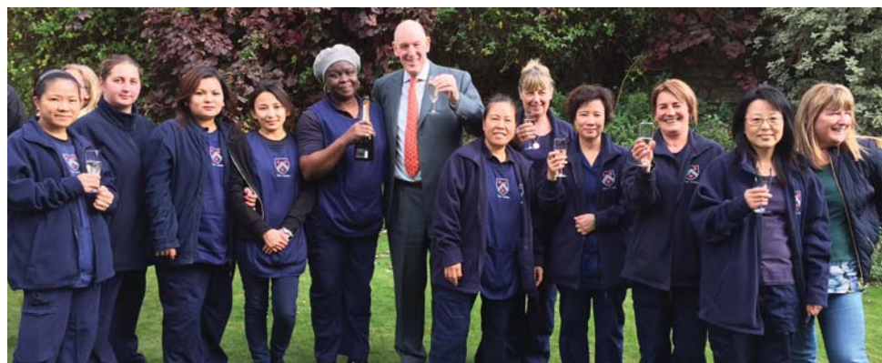
The Warden with a group of Scouts at his welcome drinks for College staff