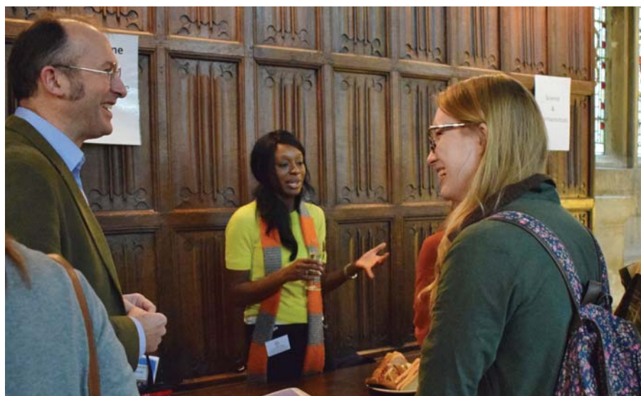
LEFT: 12 NOVEMBER 2016