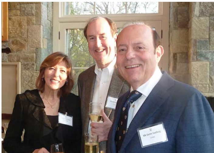
ABOVE LEFT: 9 APRIL 2016