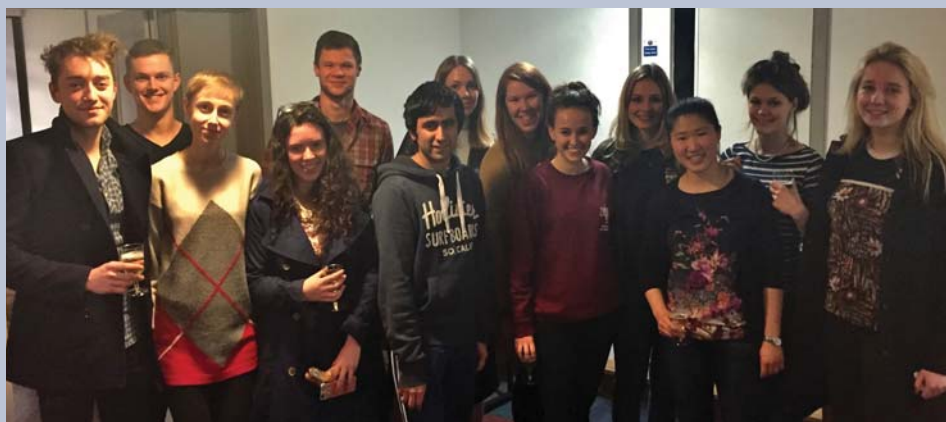
The 2015 team of student callers