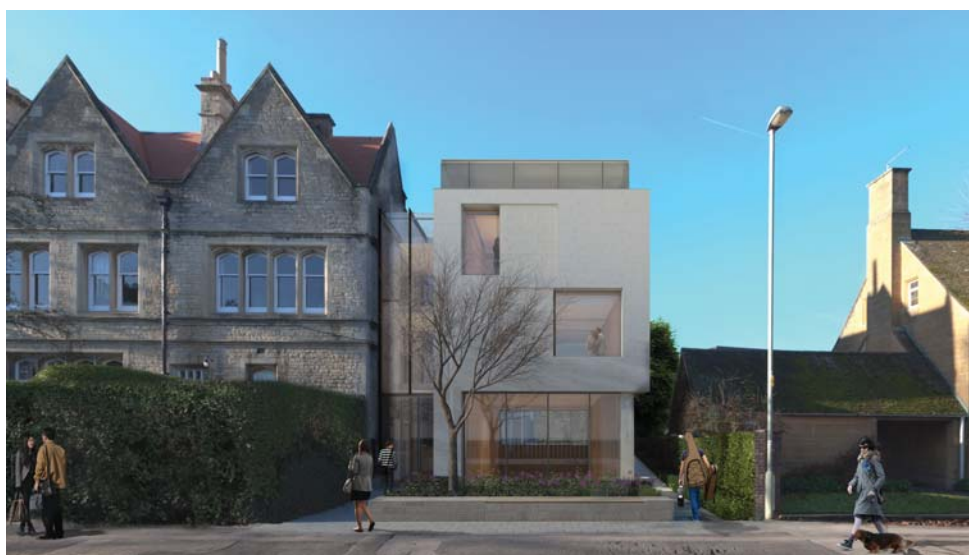
The new Music Building from Mansfield Road

Headington stone and mortar do not a college make, even one so beautiful as ours. More important are the students and their achievements. I have been amazed that during all the upheaval of buildings work, morale has remained high. Most affected have been the 2015 graduating class, who lived for more than two years in temporary hall and in the midst