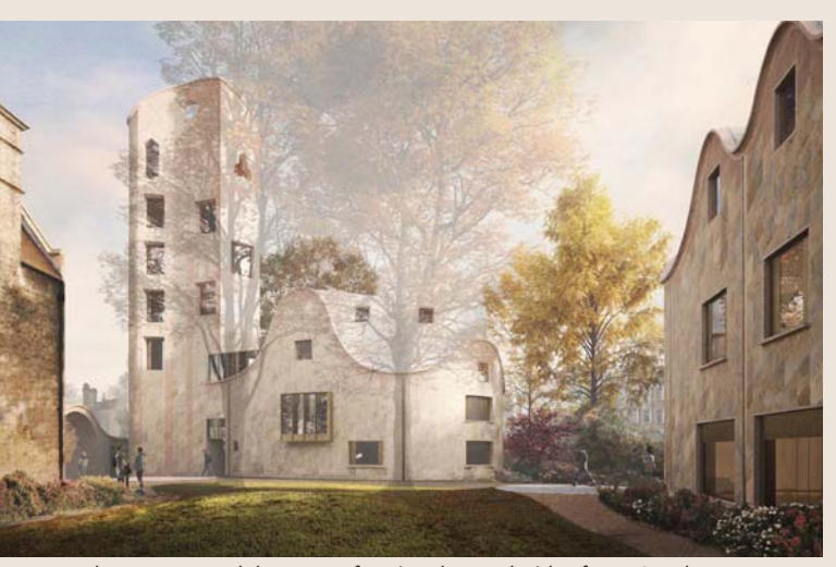
New Warham House and the Tower, forming the south side of East Quad