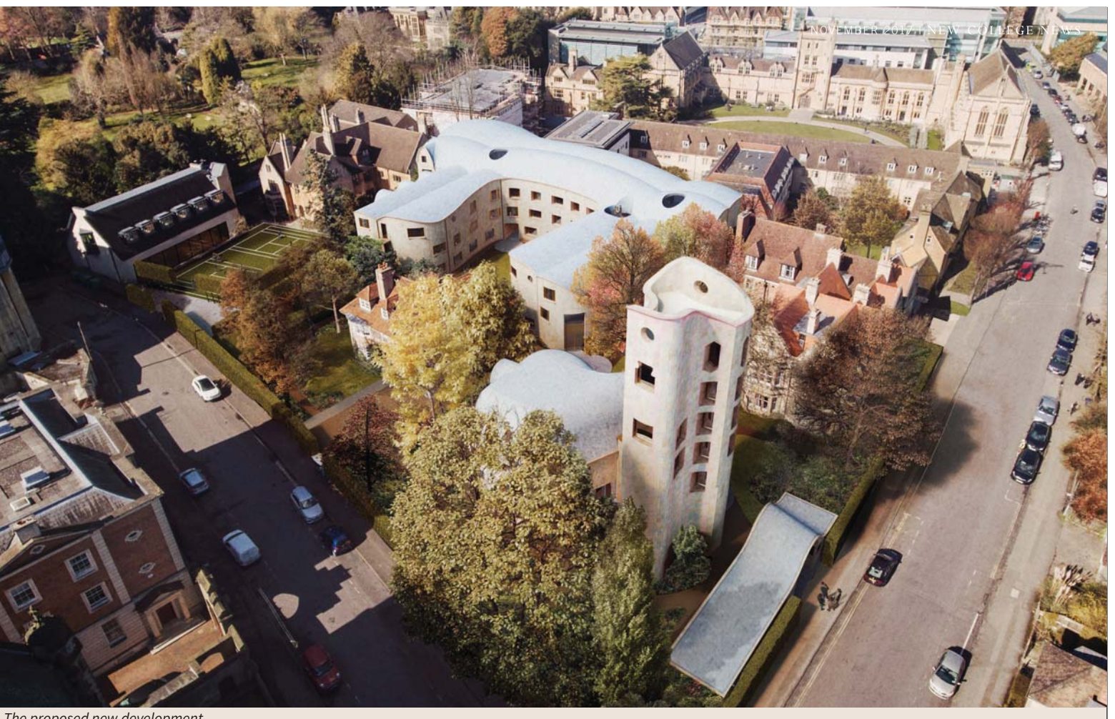
The proposed new development