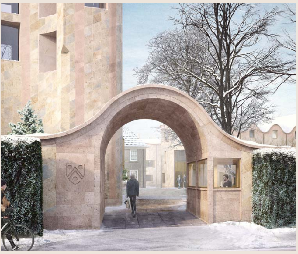
The main entrance to the site through a new Porters Lodge on Mansfield Road

on site next summer. The complexities of the site and the necessary phasing of the project suggest that it will take three years to complete the whole development.