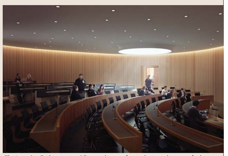
The Learning Exchange, providing work space for students and a venue for lectures and talks