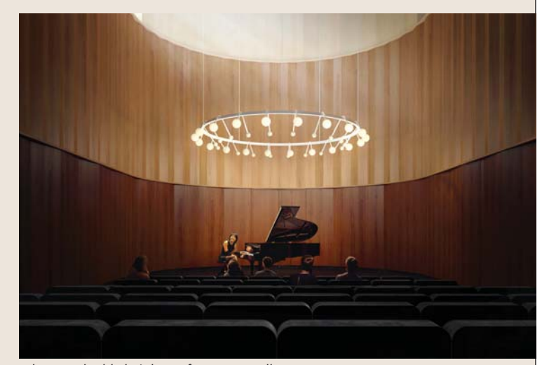
The new double height Performance Hall